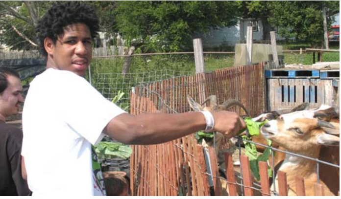
Restorative Community Service teams from the CJRC serve Growing Power.

The Benedict Center will soon be surveying all worksites the restorative community service teams have served over the last five